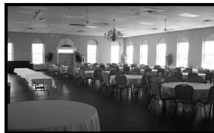
Table decorations Alcohol and related license/permits Liability Insurance (through renters home owners) Bartenders (2 required) DJ or Band

Note: Caterer must be pre-qualified to provide services to this facility.